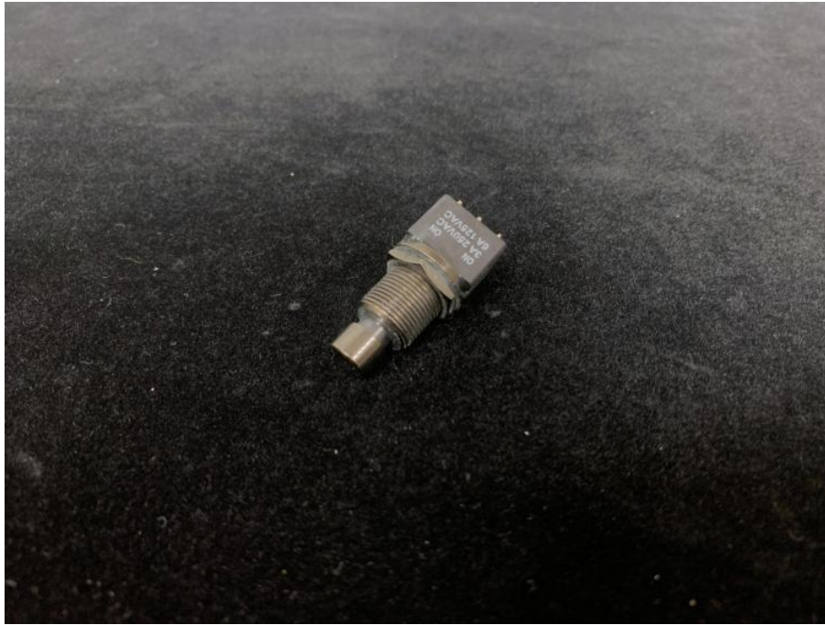
IP68 after the test