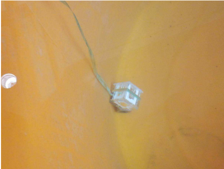
IPX7 after the test