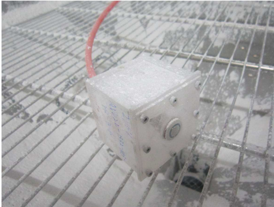
IP6X after the test