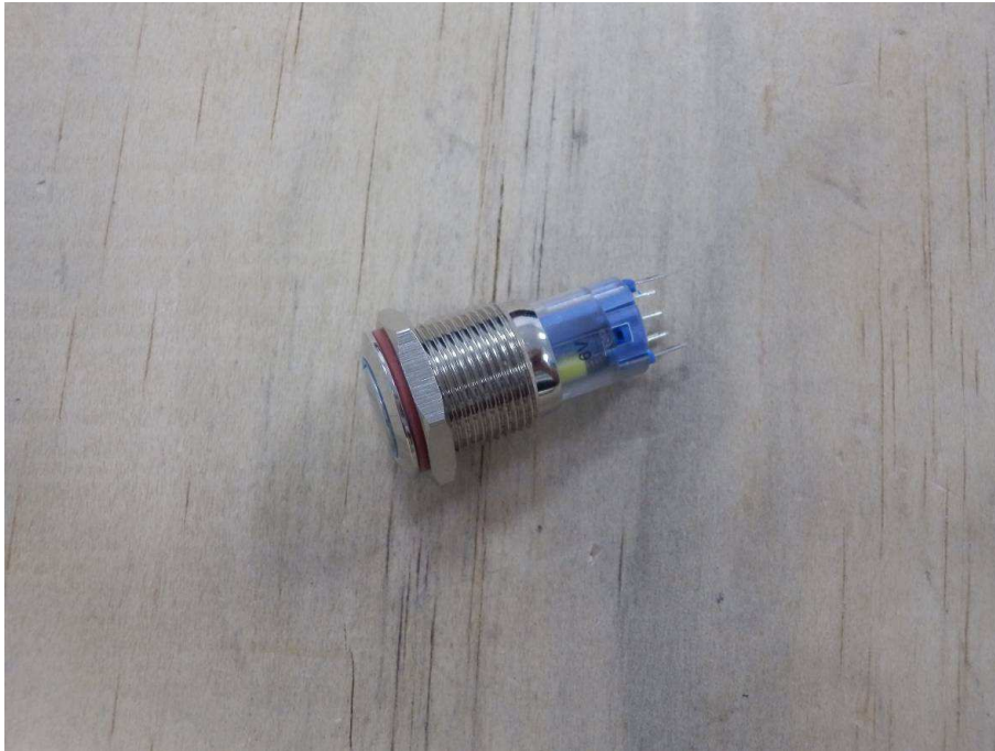
The appearance of photo